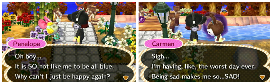
Figure 2: Examples of interactions with sad NPCs, both interactions begin and end with the dialogue windows shown. The two NPCs made each other sad by getting into an argument that the player had no part in instigating or directing, and they are both inconsolable afterwards.

Other examples of agency limitations are the more rare instances when your villagers refuse to let you interact with them. This primarily occurs when the villagers are sad or angry, which can happen either as a result of an argument with another villager, or as a result of the player acting improperly or abusing them. Once a villager is made sad or angry, the player will not have any means of interaction that can cheer them up and make them talkative again (see Figure 2).